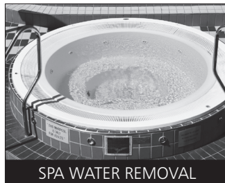
SPA WATER REMOVAL