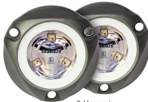
Sold as a pair