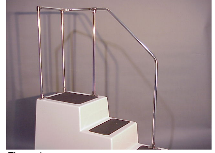
Figure 5 Figure 6