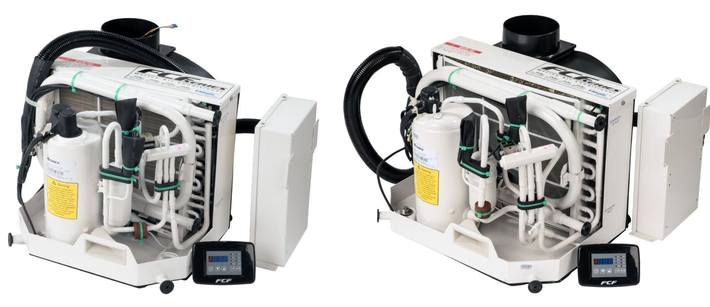
FCF Classic 12,000 BTU/h