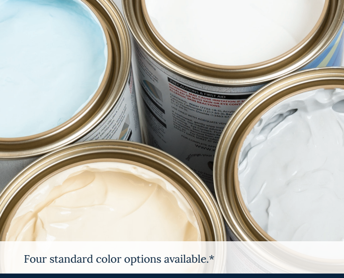
Four standard color options available.*